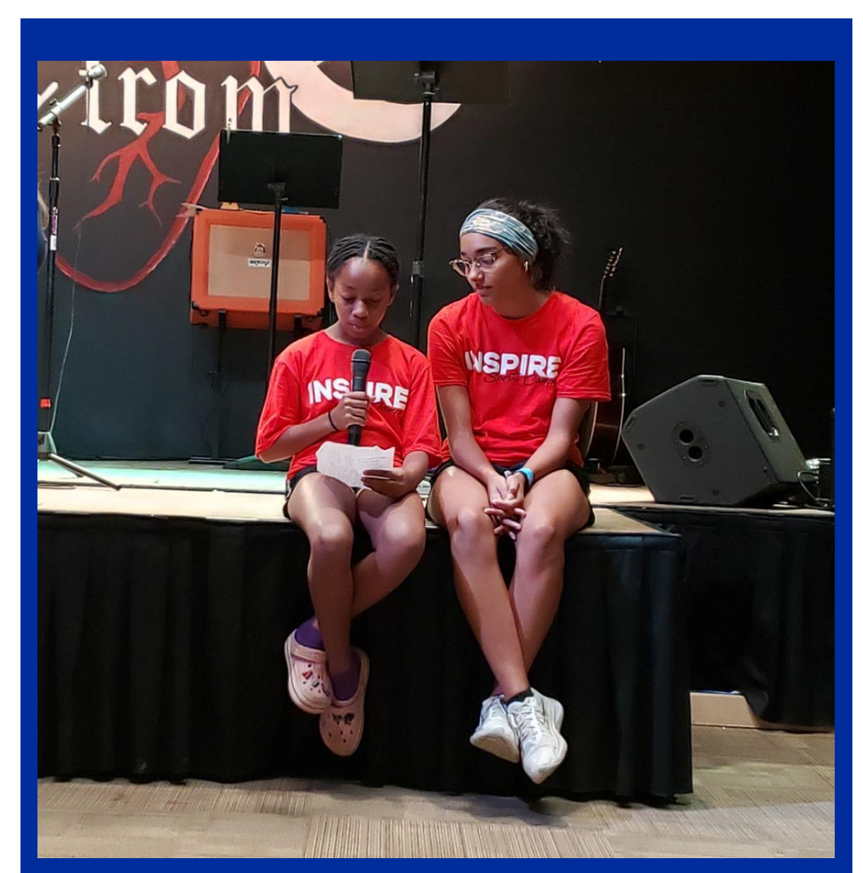
This camper shared, "After learning more about God and what Jesus did for me this week, I rang the bell and accepted Jesus... I am no longer in a bad mood and I am going home with so much love for my family and more importantly for God."

Staff Training B begins on Wednesday, July 13, and Camper Term Three begins on Sunday, July 17. Thank you in advance for all of your PRAYERS and SUPPORT for our summer staff team and the young people that we get to love, serve, and introduce to Jesus this summer.