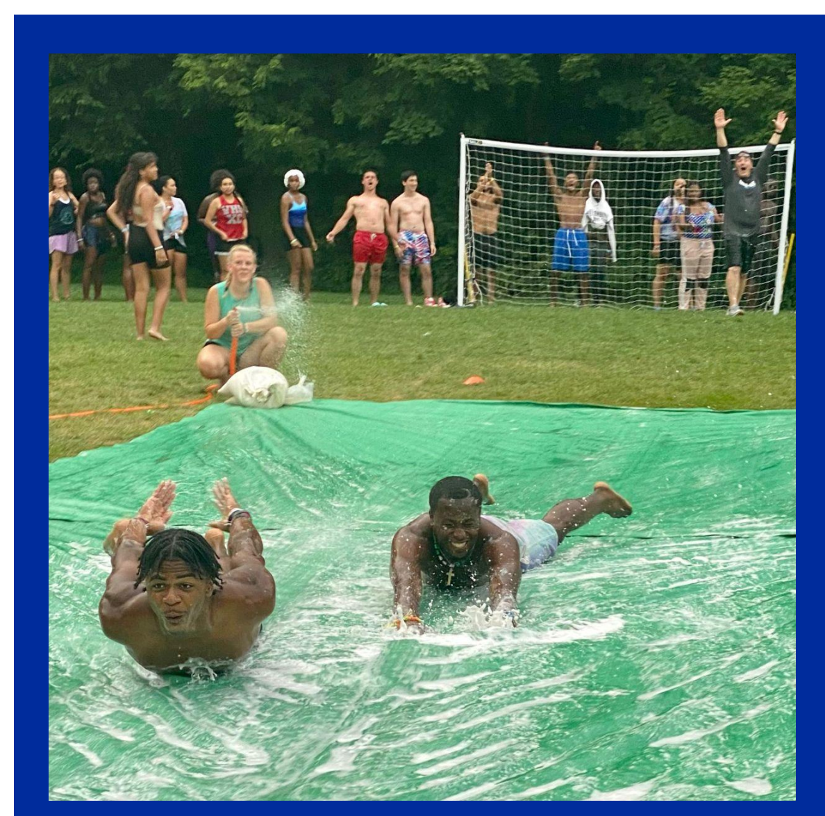
There's not a kid in America who doesn't smile ear to ear when sliding down a Super Slip N' Slide!

Thank you for all of your PRAYERS and SUPPORT for our summer staff team and the young people that we had the opportunity to love, serve, and introduce to Jesus this summer.